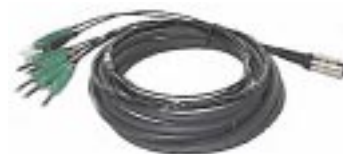
Not included in package due to limited use/application

Use: Universal oscilloscope, channels A1 to A6