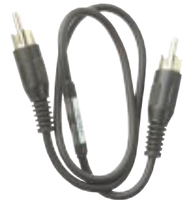
334-HKR045 & 334-HKR046 Not included in package due to limited use/application