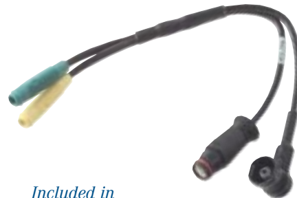
Included in package 334-HP1