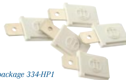
Included in package 334-HP1