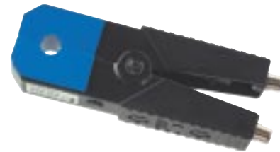
Not included in package due to limited use/application

Use: For measuring secondary voltage with 334-HKR043