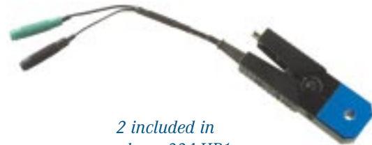
2 included in package 334-HP1

Use: For measuring secondary voltage at ignition cables