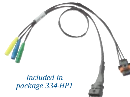
Included in package 334-HP1